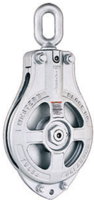
J-566 W/OBLONG SWIVEL EYE